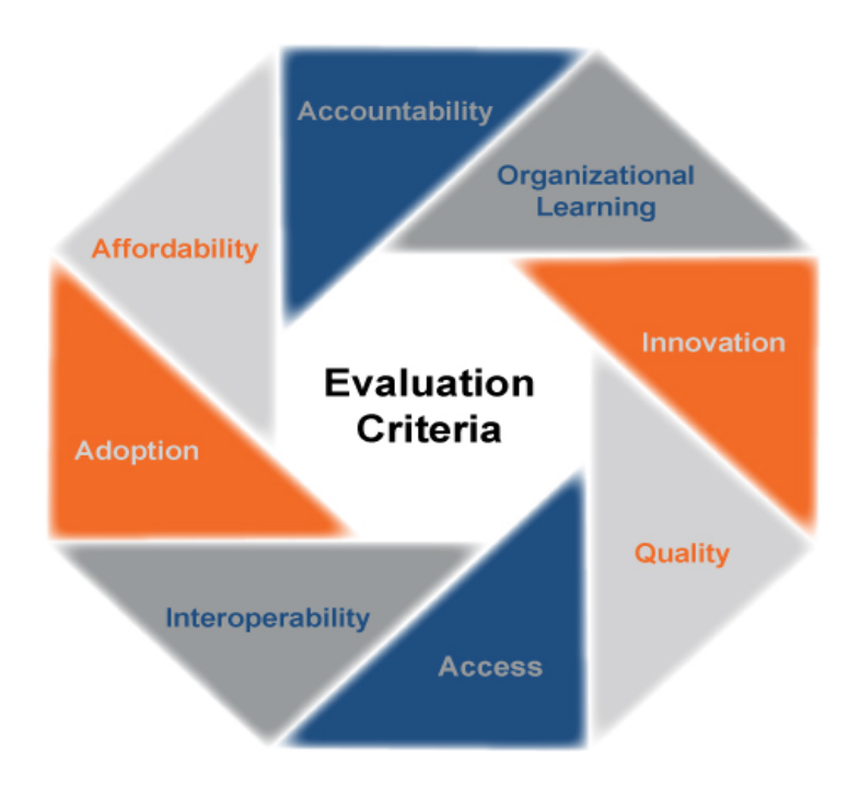
FIGURE 2. LEARNING IMPACT AWARD EVALUATION CRITERIA

IMS Global Learning Consortium's annual Learning Impact Awards (LIA) program recognizes applications of educational technology that address significant educational challenges. Regional winners, along with other finalists selected by LIA evaluators, advance to the final round of competition, which is held in conjunction with the annual Learning Impact Leadership Institute. Judges assess LIA entries based on the use of technology in an educational institution context, using eight learning impact evaluation criteria: Access, Accountability, Adoption, Affordability, Innovation, Interoperability, Innovation, Organizational Learning, and Quality (Fig. 2). IMS Global announces the platinum, gold, silver, and bronze medalists at the Learning Impact Leadership Institute.