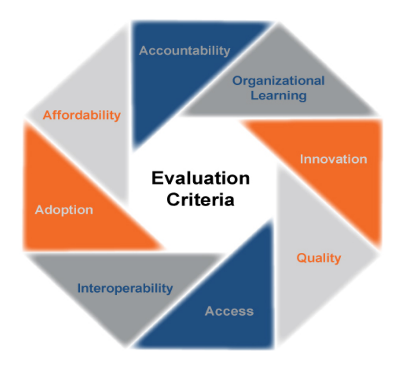
FIGURE 2. LEARNING IMPACT AWARD EVALUATION CRITERIA

IMS Global's annual <u>Learning Impact Awards Program</u> is conducted on a global scale to recognize outstanding, innovative applications of educational technology to address significant educational challenges. Regional winners, along with other finalists selected by LIA evaluators, all advance to the final round of competition, which is held in conjunction with the annual Learning Impact Leadership Institute. Evaluators assess LIA entries based on the use of technology in an educational institution context, using eight Learning Impact <u>evaluation criteria</u>, as illustrated in Figure 2. The platinum, gold, silver, and bronze medalists are announced at the Leadership Institute.