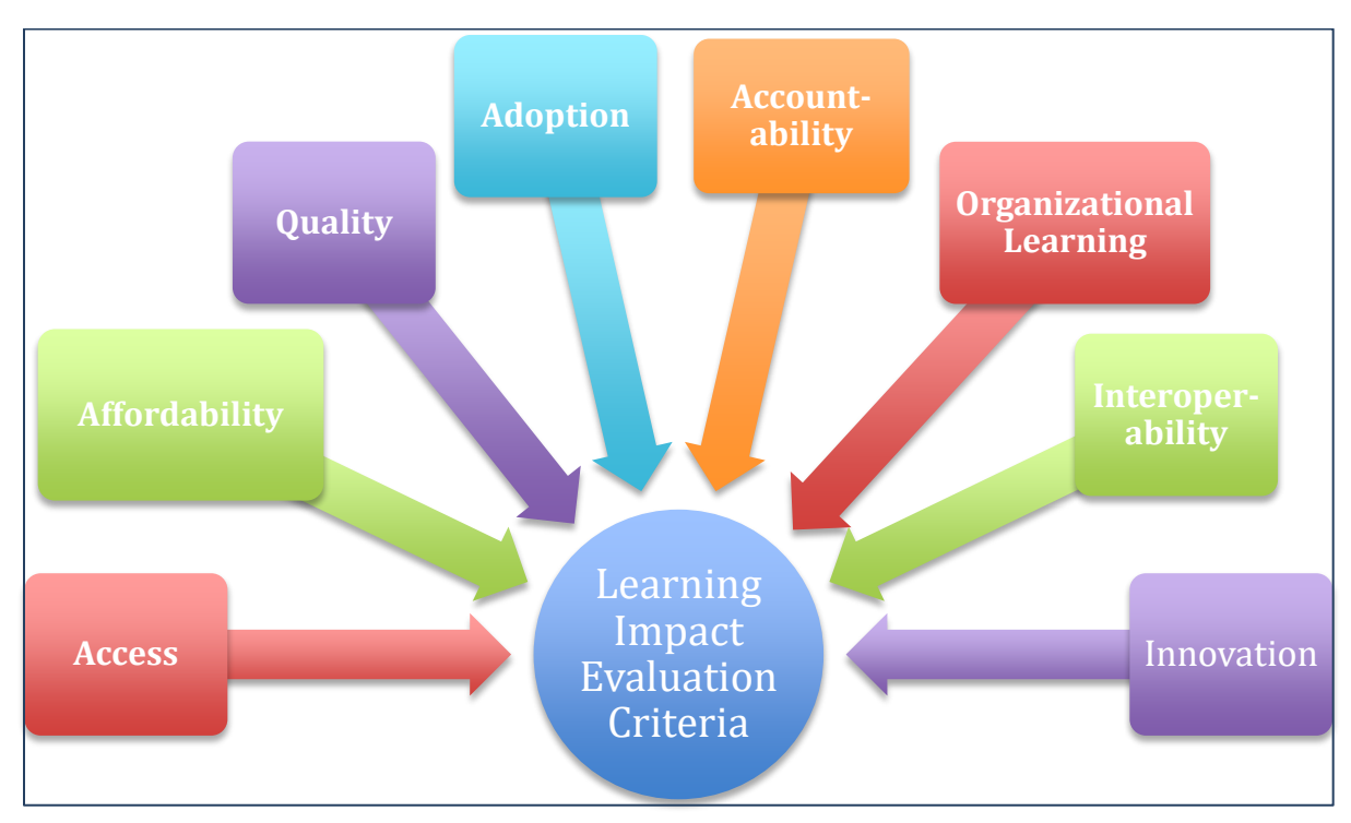
Figure 1--Learning Impact Award Evaluation Criteria

What distinguishes IMS Global's LIA awards is its pragmatic focus. Compared to other award programs in the education sector, a greater amount of work goes into the LIA evaluation process. Judges assess LIA entries based on the use of technology in an educational institution context, using eight learning impact criteria, as illustrated in Figure 1 and further detailed in Appendix B.